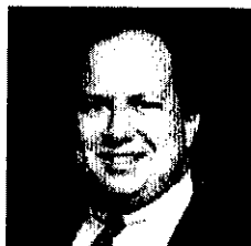
Professor of Practice Vice President for Economic Development for the Mellon Pitt Carnegie Corporation email: ds2i@andrew.cmu.edu